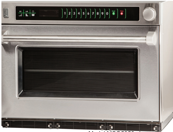
Model MSO5353 shown