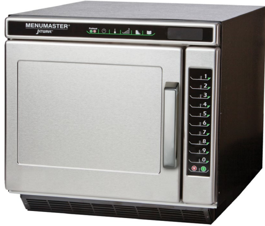
Model JET5192 shown